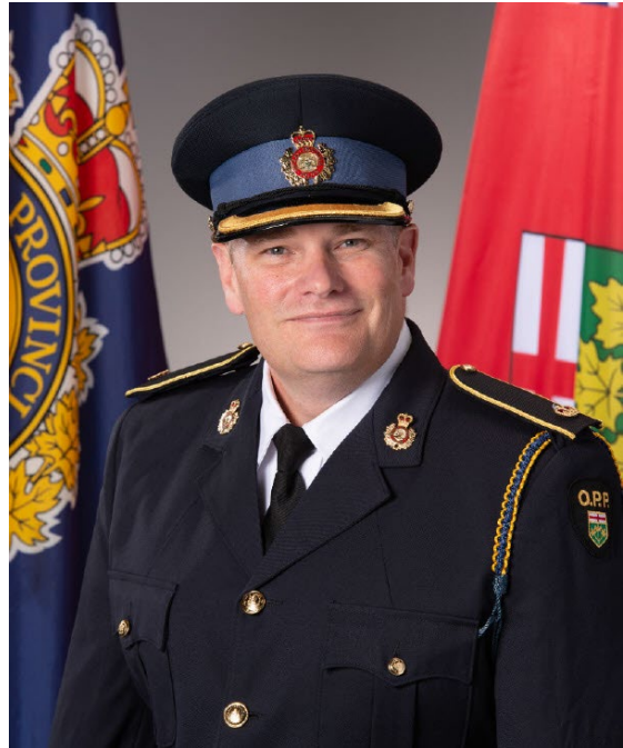
Grey-Bruce OPP Detachment Commander

Lastly, I wanted to thank the Police Service Boards and Councils for a warm welcome back to Grey Bruce and thank everyone for their participation in public safety.